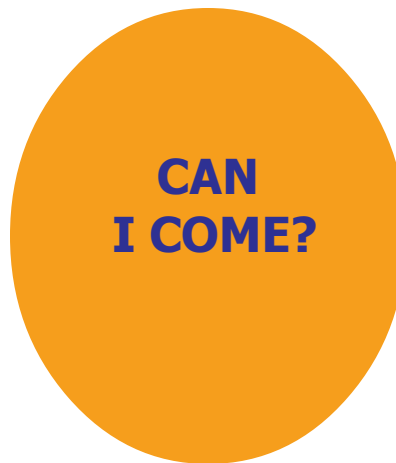
Exhibit and Show Committee

"Art to the Tune" at the Red Poppy Cafe located at the Georgetown Library, 8th Street and Austin Avenue. Enjoy an afternoon of music and art. You may draw, paint, pastel or use any media you enjoy most. Looking forward to sharing ideas and conversation.