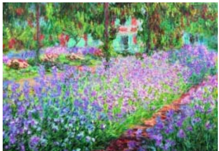
le jardin de Monet