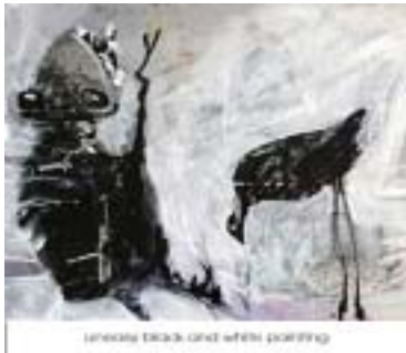
uneasy black and white painting

Uneasy Subject Matter: Think Lucien Freud, Odd Nerdrum, Joan Brown.