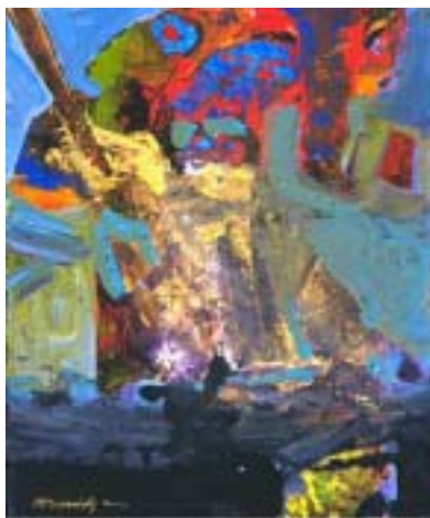
uneasy composition: "safe harbor"

For example, drawing attention to the edge of the painting by placing objects along the edge or at the corners can create weird tension. It looks like the artist ran out of room or didn't plan ahead. In other words, the placement of objects or hard-edge lines that draw your attention away from the center of interest may not make visual design sense if you don't have another object or edge to draw your eye back into the painting. If your focus leads you out of the picture, it may send a confused, uneasy message. If that is what the artist intended, then the painting is successful! ■