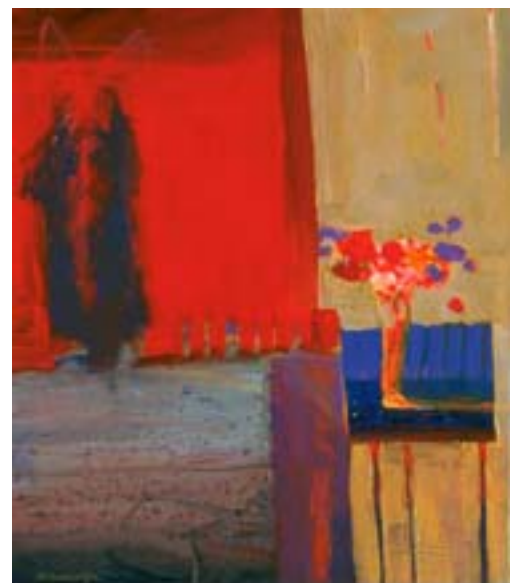
uneasy composition: "whisper secrets"