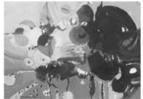
Golden Section Black and White Painting

Do this: Divide your paper or canvas into thirds, vertically and then divide same paper or canvas into thirds, horizontally. You've drawn a Tic Tac Toe grid. Where the lines cross over each other, that will essentially mark the four spots for you to "place" four objects.