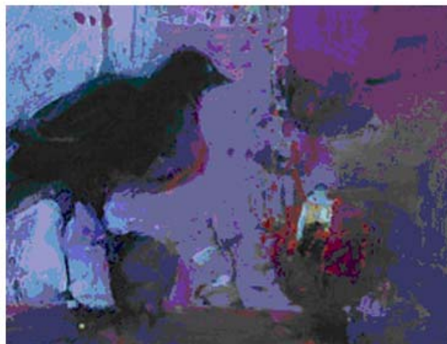
Golden Section Painting

A word of caution... this Golden Section design is only used by me as a starting point. I move things around loosely, keeping the objects close to their measured location. My goal is to not have the painting appear static so I might camouflage those points a bit and not make the grid design look so obvious. So there you have it — The scientists' version of protractors, fractions, geometry and proportional esthetics, or the simple "I don't have that much time left" Bob Burrige system of tick tac toe!"