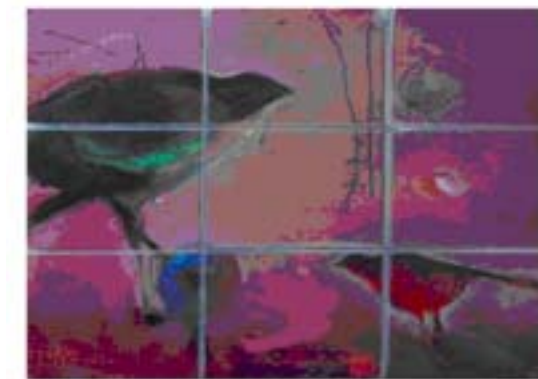
Golden Section Grid

understand, figure it out and be able to explain it to anyone who is willing to listen. But, while reading the explanation something happens to you within minutes. You quit reading! Why? Because the author is taking about math - and math is a major mystery to us creative-types. They talk about fractions, ratios, geometry, mechanical drawing stuff like... the length of the whole line divided by the length of the larger part must be in the same ratio as the length of the larger part relative to the smaller part. And I have not even talked about 0.617 and 0.383 ratio